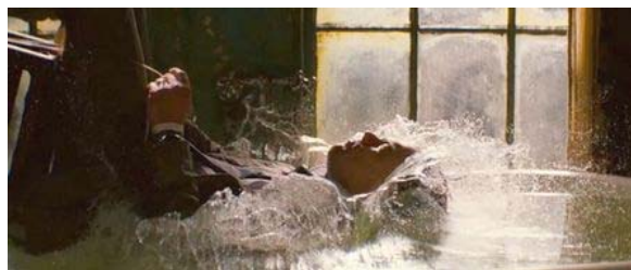
Cobb sees water pour through the pagoda windows (left), and he's "kicked" back into "reality" (right).