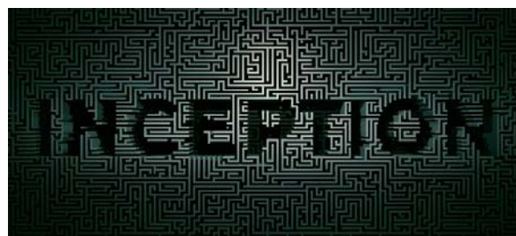
The maze motif in both the film and production company title. (Screen grabs)

As a filmmaker focused on minute details, with an analytic fervor that is difficult to understate, Nolan's regimentation of the dream space is of interest. More to the point, the film argues for a construction of dream space that is far separate from the traditional oneirological systems of the Freudian reflection of the subconscious, or even more recent experimental theories such as Jie Zhang's process of "continual activation." 1 Instead, dream space is constructed and overseen as a parallel effort between the dreamer, the "architect", and, to some extent, what can be construed as the oneiric intruder (a process the film refers to as "shared dreaming"). This is, in essence, the central theme of Inception , in that the very experience of extraction, the encroachment into another's dream, raises questions about the very nature of individual independence in a utopic/dystopic future that such a thing as "inception" could even be possible. Most importantly, though, the invocation of "the architect", along with their created dream spaces, very much operates to expand our understanding of "built space" within architectural anthropology as it relates to filmic space. 2