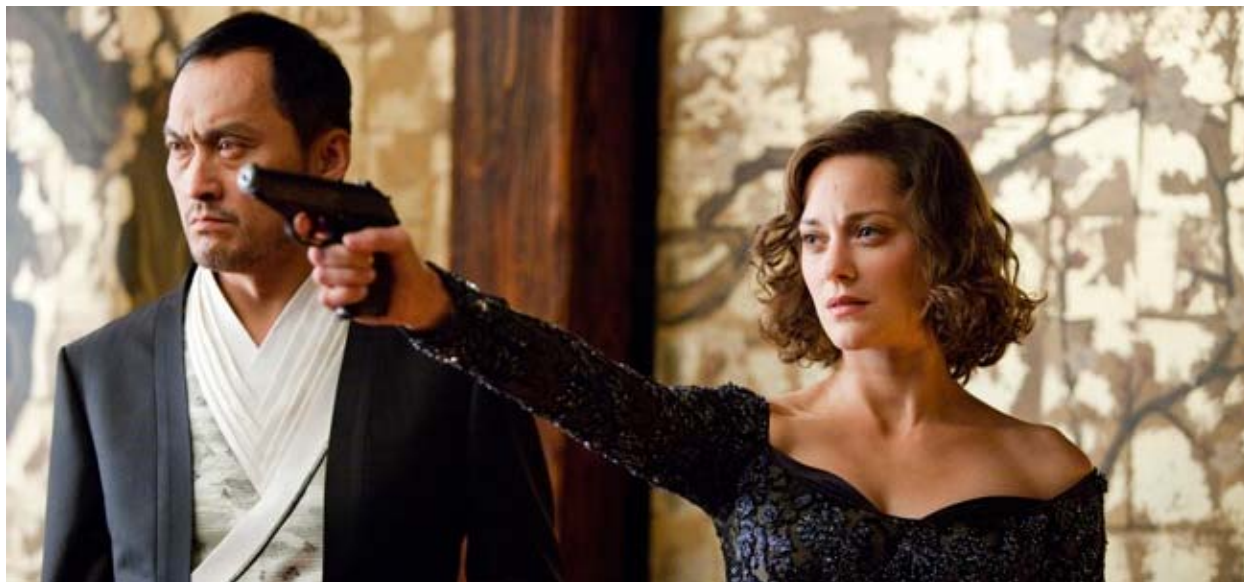
Mal, along with Saito, intervenes in Cobb's plans. (Screen grab)

primarily expect to see Ariadne as the primary figure of this process of creation, that of shared dreaming, and the emergence of Mal into that space raises serious questions about the actual independence of the dreamer, even within the complex interdependence of the shared dream.