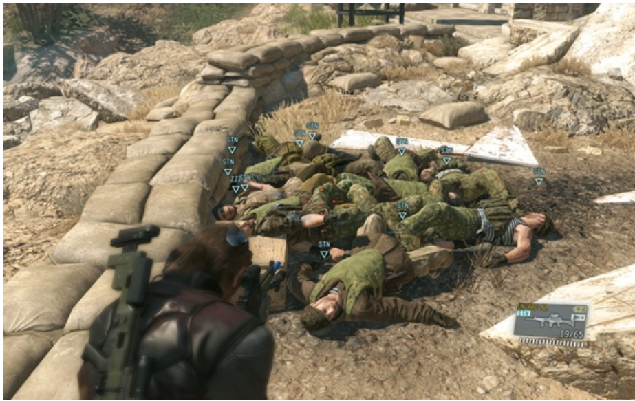
Metal Gear Solid V: The Phantom Pain

CK: This has been a difficult question to navigate. Visually, it's not very different than those videos—my project might show more of the process of creating the pile of bodies than is generally shown in similar videos on YouTube, but that is the extent of the difference. However, I certainly don't see my work as being part of that practice. I think it comes down to the issue of context. If I released my work directly on YouTube with no accompanying materials, it could easily be taken as an uncritical reproduction of that phenomenon. It's my goal, however, to not have it shown anywhere where there is not some contextualizing material to explain what's going on and what my intentions are. That context can be added just from the choice of venue. Seeing the piece in a gallery is different than encountering it online, but context can be produced in other ways as well. The forthcoming web version of the project will be accompanied by critical writing that appears alongside the piece. Even if no one reads the writing, its existence at least signals "Oh, I am supposed to be thinking about this differently than as just a mere video game spectacle."