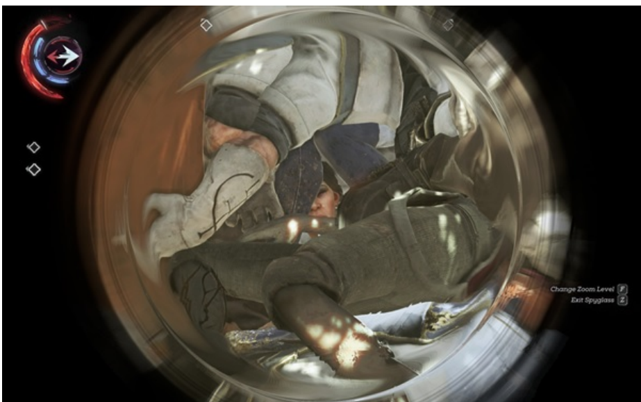
Dishonored: Death of the Outsider