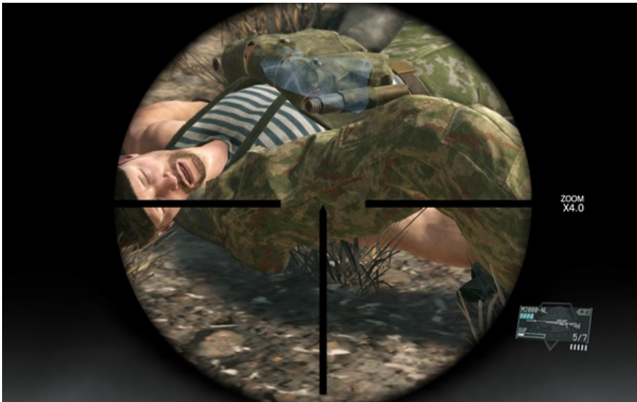
Metal Gear Solid V: The Phantom Pain