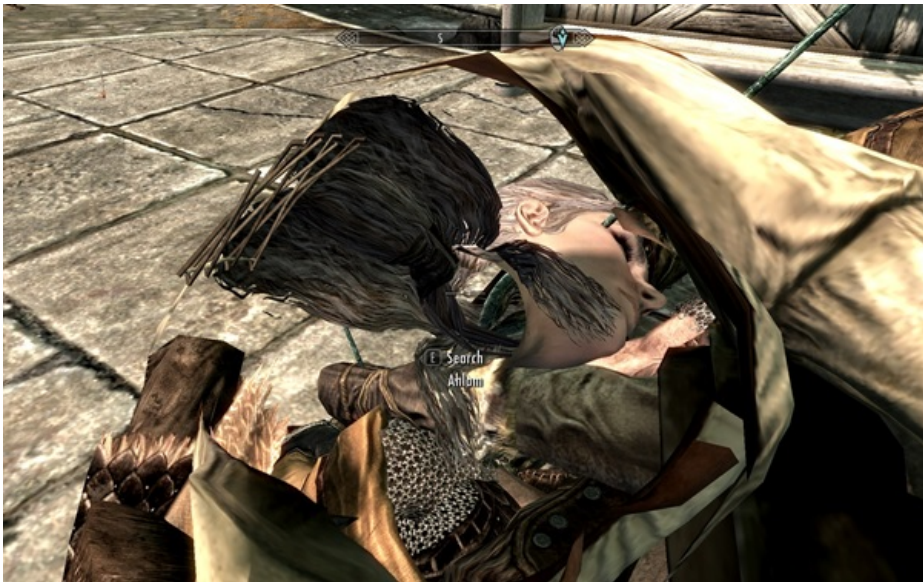
The Elder Scrolls V: Skyrim

As for why I operate in the bounds of original intent in this project: it's because I want the project to speak to the games themselves. It's why I leave the UI in and record the whole process of creating the pile in these videos. I want a potential viewer to really understand that nothing is being added. When things are added, it can dilute the focus. This isn't about how great a piece of video art I can make using a game, it's about the game as an artifact—what it looks and feels like to play. If someone were to go and buy one of the games in the project and play it—i.e. an unmodded version—the game they're playing is the same one that I use. That grounds the piece in real experience.