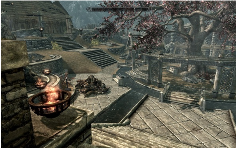
The Elder Scrolls V: Skyrim

CK: I went into this project really wanting to focus on new, big budget (what are known as AAA) games since those are played by a wider audience. In terms of formal qualities, my strictest requirement was that I needed games where you can manipulate dead or unconscious bodies. There are many AAA games that involve killing or knocking people unconscious, but it's only in the stealth-action and immersive-RPG subgenres do these elements reach a point where my project could be feasible. That's how I ended up with these four core games: Dishonored: Death of the Outsider , Skyrim , Hitman , and Metal Gear Solid V . The visual qualities are a result of those constraints. Games where dead bodies can be moved at whim tend to value fidelity and "realism." The games industry defines this realism within a specific set of conventions. Detailed character models, busy environment design, and even certain washed out color palettes are intended to communicate realism and fidelity visually, where the ability to move bodies around communicates it mechanically.