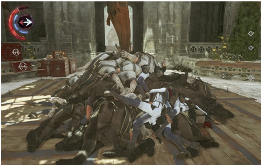
Dishonored: Death of the Outsider