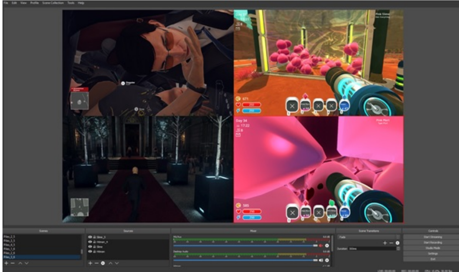
Screenshot of Kerich Editing Game Clips for Piles

I hadn't thought about this until reading your question, but I realized my videos are oddly styled after similarly laborious gaming practices like speedrunning, especially to the extent that videos are used as proof in that community. In the speedrunning community to show that you have beaten a game in a certain length of time, it's usually required that a video showing that feat be uploaded. My project is different than speedrunning in many ways, but these videos are also proof. They're proof of what the game is and how it operates, they show that I actually did what I claimed to have done. Both speedrunning and my own project's need for proof may unconsciously stem from the capitalist imperative that work must have tangible results, but that's just unfortunately what it is.