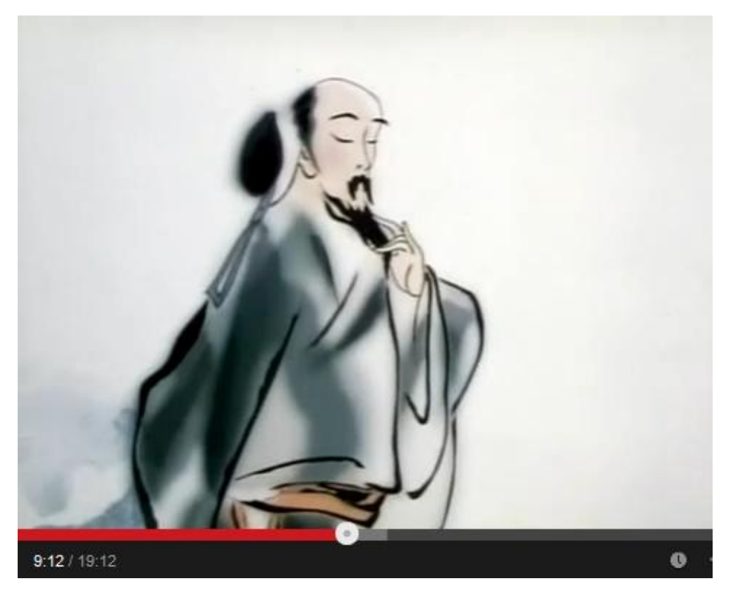
FMW, Image 13