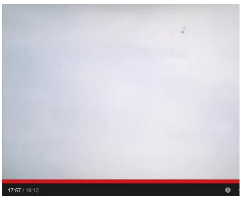
FMW, Image 12 (See upper right corner)

The young boatman (now the successor of the aged musician) playing zither in the background, along with the invisible literati teacher at the end of the film, makes up for the absence of reality in the motion-picture with a sense of poetic subjectivity because only spectators with a profound knowledge of Chinese literati culture are capable of associating all these cinematic fragments to form a coherent unity for further cognition. As with Deren's notion of "archetype" (Deren 66) in early Western films, archetypes in Chinese classical poetry also play a significant role in shaping poetic subjectivity in Chinese cinepoetry. For example, the recurrent close-up of the musician twisting his beard while shutting his eyes is a symbolic gesture of thinking/contemplation: