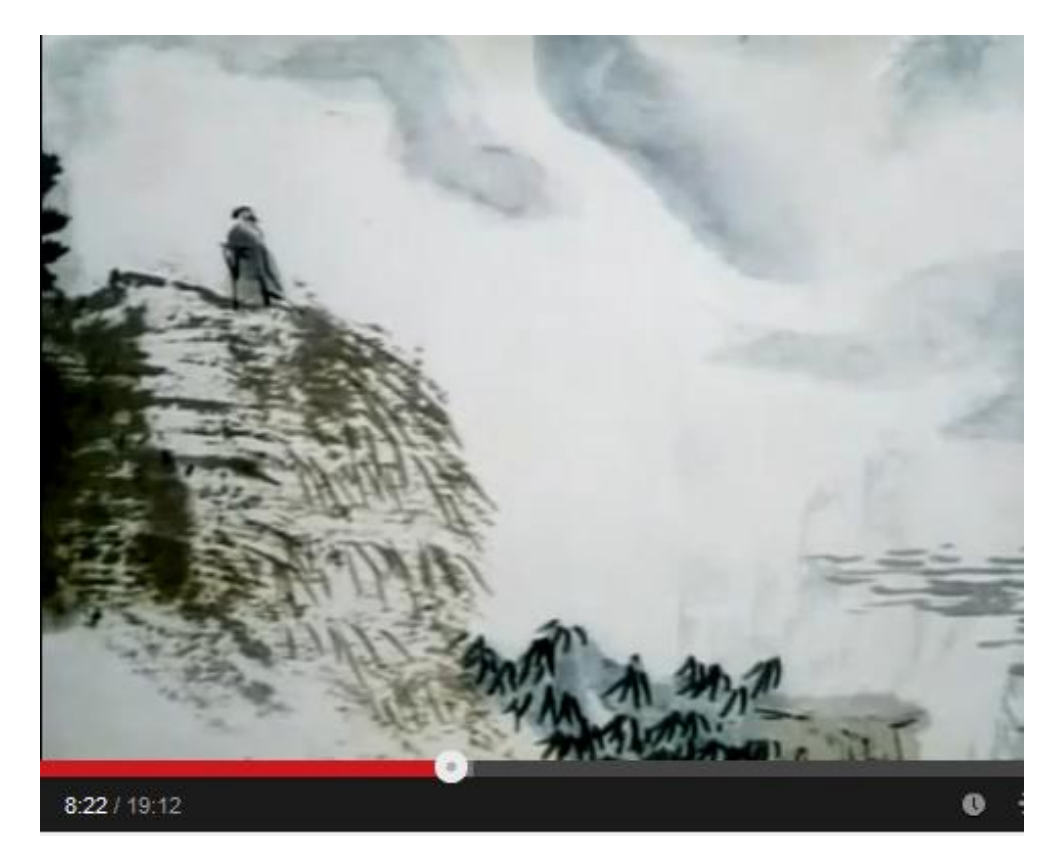
FMW, Image 3