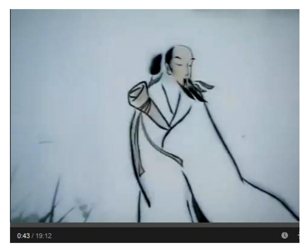
FMW, Image 1

The rugged and remote images of the vast and untamed wilderness, which had been the central theme of T'ao and Hsieh, also predominate the screen throughout the film: