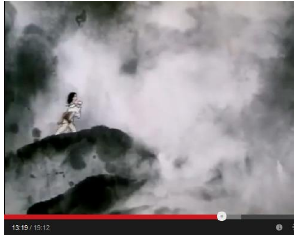
FMW, Image 10 (See lower right corner)

In the second shot, the musician is a white, ghostly shadow, accompanied by the hollow sound of the wind followed by the upbeat melody of a flute song (which preludes the emergence of the image of the young boatman and the unfolding of the film narrative), moving slowly into our vision, an image which corresponds to Wang Wei's poem "Vagary Lake": "Flute-song carries beyond furthest shores. / In dusk light, I bid you a sage's farewell. // Across this lake, in the turn of a head, / mountain greens furl into white clouds" (trans. David Hinton). To say that the film is an epitome of many poems is not whimsical, for this shot may also correspond to a verse line by T'ao Ch'ien that "[v]ast and majestic, mountains embrace your shadow; / broad and deep, rivers harbor your voice" (trans. David Hinton). This is especially true when the story draws to a close, where the teacher left his zither to the student as a gift, dissolving slowly into the vastness of the landscape as a white shadow again: