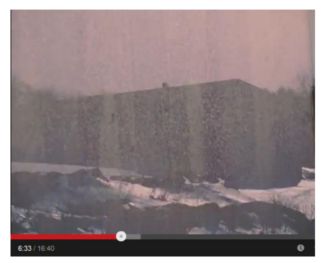
Vision through Window Pane Image