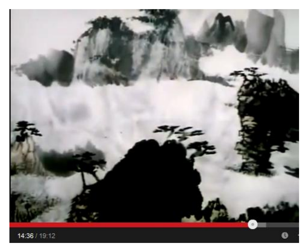
FMW, Image 7

In a deeper sense of my statement, almost every single shot of the film is capable of matching with a particular poetic line composed by Chinese nature poets. The two screenshots below, for instance, perfectly visualize the poetic lines by Liu Tsung-yüan (773-819), one of the Tang Dynasty's leading rivers-and-mountains poets and China's most important Tang nature painter-poet Wang Wei (701-761), who was an adamant proponent and practioner of Ch'an (Zen) Buddhism and the first to paint the inner spirit of landscape in his painting and weave consciousness into wilderness in his poetry: