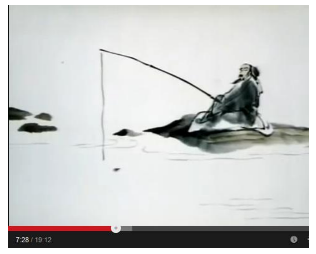
FMW, Image 8

In a deeper sense of my statement, almost every single shot of the film is capable of matching with a particular poetic line composed by Chinese nature poets. The two screenshots below, for instance, perfectly visualize the poetic lines by Liu Tsung-yüan (773-819), one of the Tang Dynasty's leading rivers-and-mountains poets and China's most important Tang nature painter-poet Wang Wei (701-761), who was an adamant proponent and practioner of Ch'an (Zen) Buddhism and the first to paint the inner spirit of landscape in his painting and weave consciousness into wilderness in his poetry: