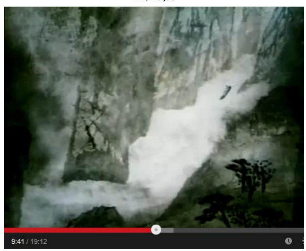
FMW, Image 6