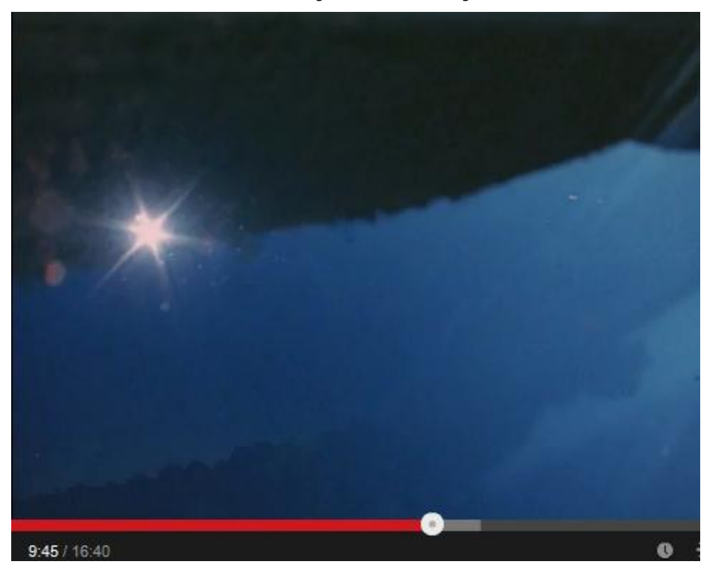
Landscape and Human Dwelling Image