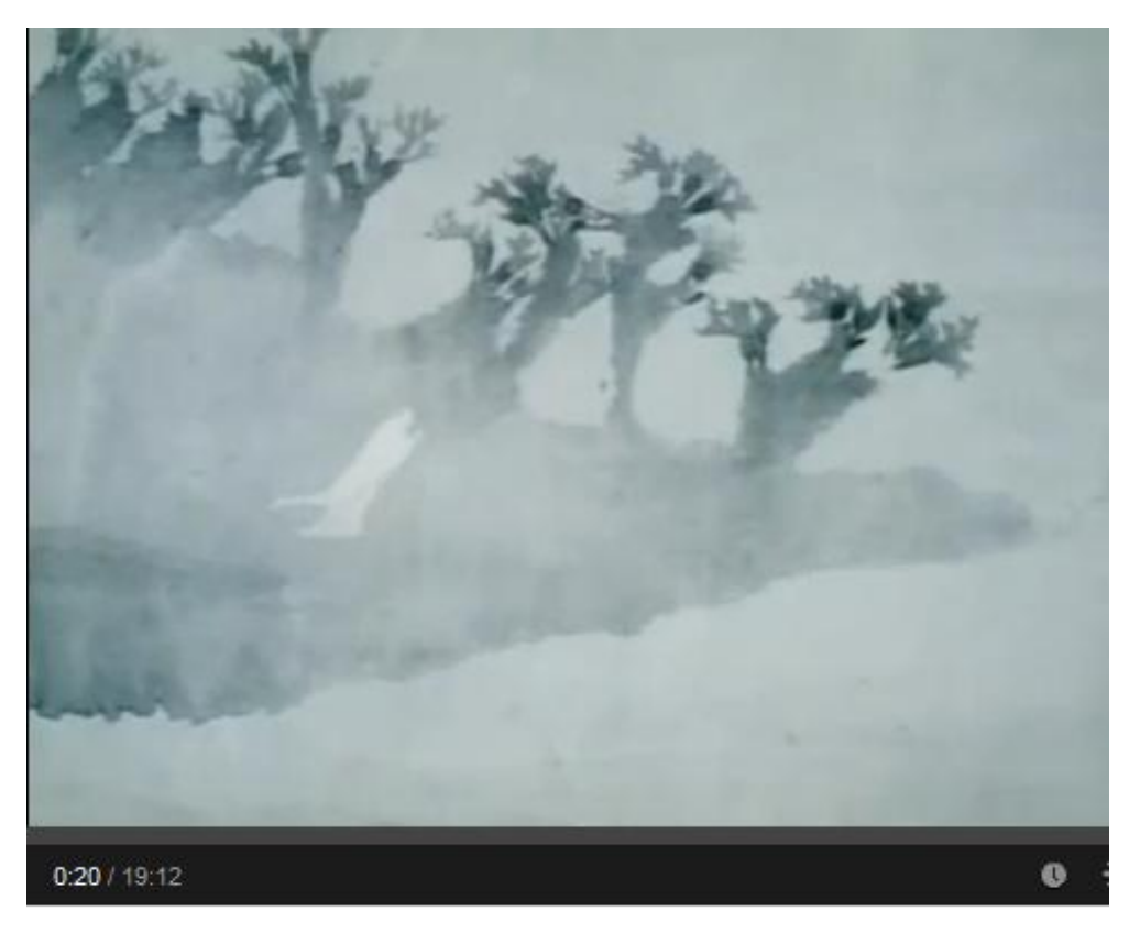
FMW, Image 9

In the second shot, the musician is a white, ghostly shadow, accompanied by the hollow sound of the wind followed by the upbeat melody of a flute song (which preludes the emergence of the image of the young boatman and the unfolding of the film narrative), moving slowly into our vision, an image which corresponds to Wang Wei's poem "Vagary Lake": "Flute-song carries beyond furthest shores. / In dusk light, I bid you a sage's farewell. // Across this lake, in the turn of a head, / mountain greens furl into white clouds" (trans. David Hinton). To say that the film is an epitome of many poems is not whimsical, for this shot may also correspond to a verse line by T'ao Ch'ien that "[v]ast and majestic, mountains embrace your shadow; / broad and deep, rivers harbor your voice" (trans. David Hinton). This is especially true when the story draws to a close, where the teacher left his zither to the student as a gift, dissolving slowly into the vastness of the landscape as a white shadow again: