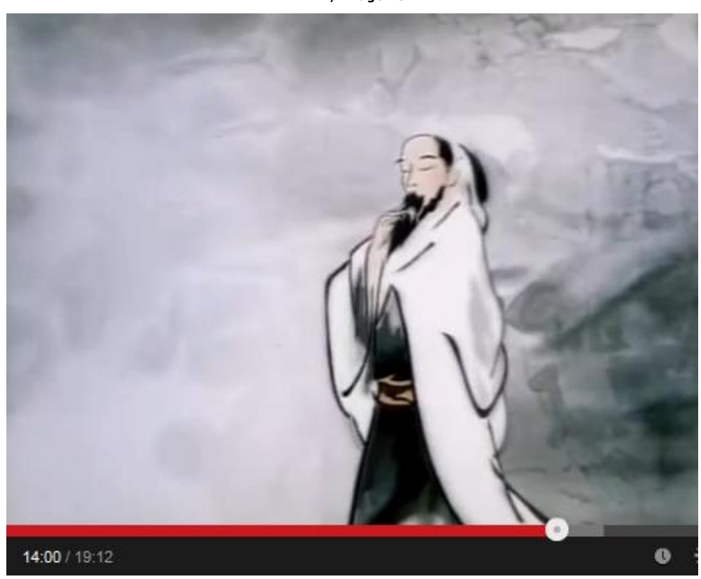
FMW, Image 14

Not only does this move invoke the spectator's association of the invisible poetic minds behind the animated painting, but it also foregrounds the filmmaker's action of seeing – not through the rhythmic movement of the camera, but through a double exposure of the mind's eye.