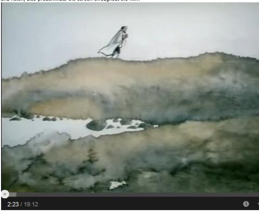
FMW, Image 2

The rugged and remote images of the vast and untamed wilderness, which had been the central theme of T'ao and Hsieh, also predominate the screen throughout the film: