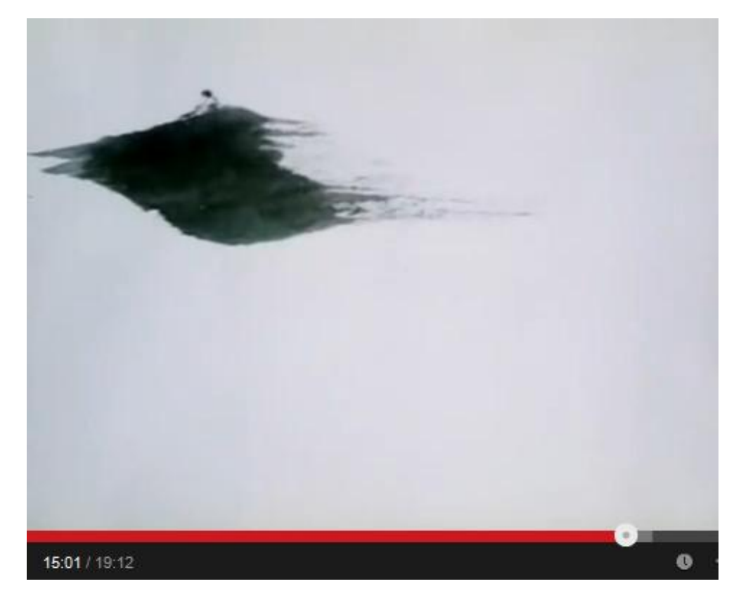
FMW, Image 11