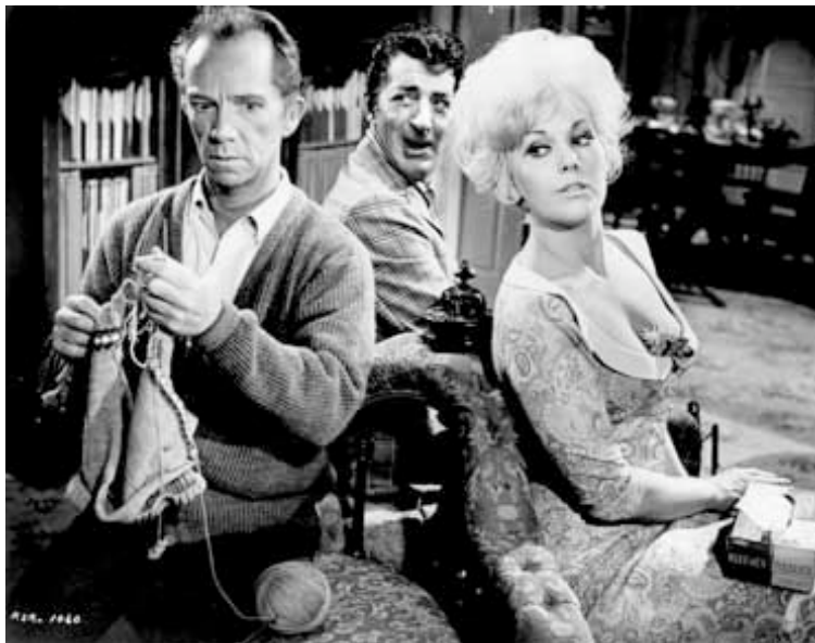
Ray Walston, Dean Martin, Kim Novak, Kiss Me Stupid

The release of the "ADULTS ONLY," "condemned" Kiss Me, Stupid provided for critics a primary example of the lurid metropolitan sensibility undermining the values of the Code and infesting domestic Hollywood product, not just European imports. 40 In a Variety article published alongside reports of the Legion's condemnation of Stupid , MGM producer Joe Pasternak aimed his fears and accusations squarely at urban influences, and reaffirmed traditional mainstream tastes in the process: "Our moral standards should not be set by New York, Chicago and Los Angeles ... The greatest movie audiences are in the smaller cities, towns and rural areas, and those people are offended by the filth that gets on the screen." Wielding the petty-bourgeois mandate for morality, discretion and education, Pasternak isolated "nudity for the sake of nakedness" and "the downright dirt" of "bed-chamber scenes." "We should make pictures for the family again," he demanded, and ended with the warning, "if we don't clean our house, it will be cleaned for us by legislation." 41 Pasternak's impassioned censure of the "dirt" and "filth" provoked by urban "moral standards" and commercially exploited by Hollywood were, like the proclamations of 1934, founded in the binaries city/country, dirty/clean, moral/immoral, and vulgar/tasteful, as well as a conception of commodity culture as pollutant of bourgeois morality. 42