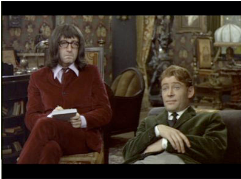
Peter Sellers and Peter O'Toole, What's New Pussycat?