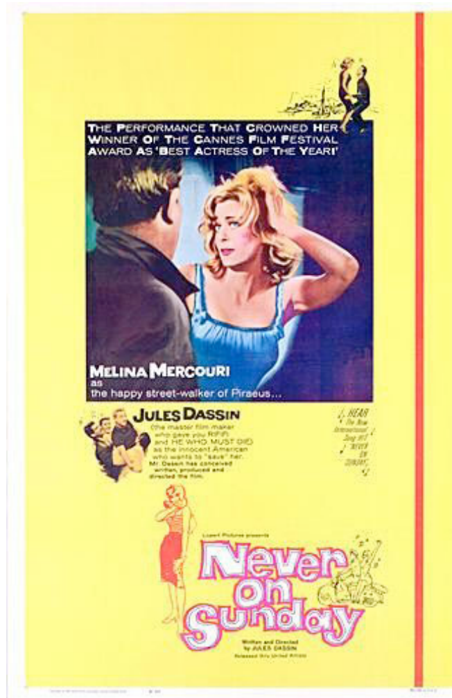
Never on Sunday (1960)

An initial sign of changing tastes manifested in the behavior of urban and college-town audiences who attended adult-oriented art films in such considerable numbers that they rivaled Hollywood product. When independent exhibitors turned to foreign art movies for material to screen in the late 1940s, 32 art films' stylistic innovations, "racy" subjects and imagery differentiated them from the Hollywood, Code-approved, family film. 33 Contrasting Hollywood movies to European productions, the Legion stated in early 1965, "The [moral] dangerousness of American films is quite less incisive than that generally present in European works." 34 Many popular foreign films about immoralists in Rome, Paris, London, and Athens entered theatres denied PCA seals and condemned by the Legion. 35