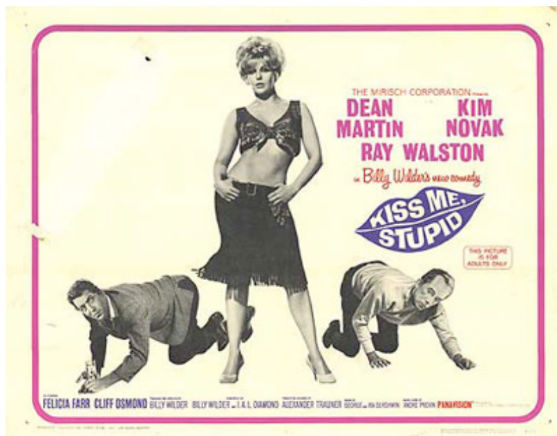
Kiss Me Stupid (1964)

Many strong cases have been made for which films launched “the new cinema,” as Time dubbed it in 1967: The Pawnbroker (1965), The Chase (1965), Who’s Afraid of Virginia Woolf? (1966), The Chelsea Girls (1966), Alfie (1966), Blow-Up (1966), The Shooting (1966), Point Blank (1967), The Graduate (1967), Bonnie and Clyde (1967), Targets (1968), Easy Rider (1969), Midnight Cowboy (1969), and many others. All of these films exemplify the incorporation of art cinema style (from jump cuts and pastiche to tragicomic irony), themes of moral ambiguity, “adult” language, sexuality, nudity, and violence; they also reflect the period of transition from the PCA to the CARA. 9 Accounts of New Hollywood repeatedly overlook the prevalence of Hollywood sex comedies in all these processes, with the exception of William Paul’s Laughing Screaming , which cites the “uninhibited sexuality” in “the landmark sex comedies of the period” beginning in 1967 with The Graduate . 10