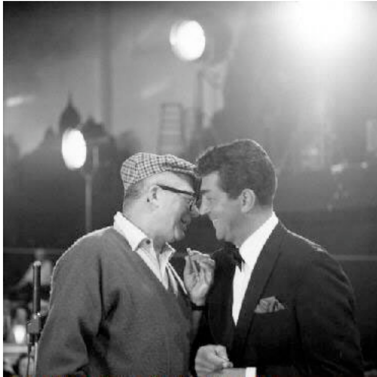
Billy Wilder and Dean Martin on the set of Kiss Me, Stupid

If the negative reviews of Kiss Me, Stupid mounted defenses of middlebrow and petty-bourgeois taste through an underlying hostility to metropolitan taste(lessness), the few endorsements of the film vindicated an urban perspective. Newsweek's critic insinuated that only an urbanite schooled in "Modern Art" and European art films could have appreciated the "dirty" and "moral" Stupid . After defending Stupid as a "moral picture," the reviewer detailed Wilder's trip to "New York to be honored at the Museum of Modern Art, which is currently presenting a two-month retrospective of Wilder's work." 47 The "condemned" Stupid indeed compared to art, European art films that the Legion also rated "C"—"Breathless," "Jules and Jim," "Knife in the Water," "L'Avventura," "La Notte," "Saturday Night and Sunday Morning," and "My Life to Live"—by ironic (perhaps elitist) contrast to the Legion's "A-1" family fare: "'Goliath and the Sins of Babylon,' 'The Earth Dies Screaming,' 'Godzilla vs. the Thing,' and 'Snake Woman.'" 48 Active in this critic's reasoning was the polarity of family films, implied to maintain "small town" values, versus foreign art movies, urban in terms of their content and American exhibition.