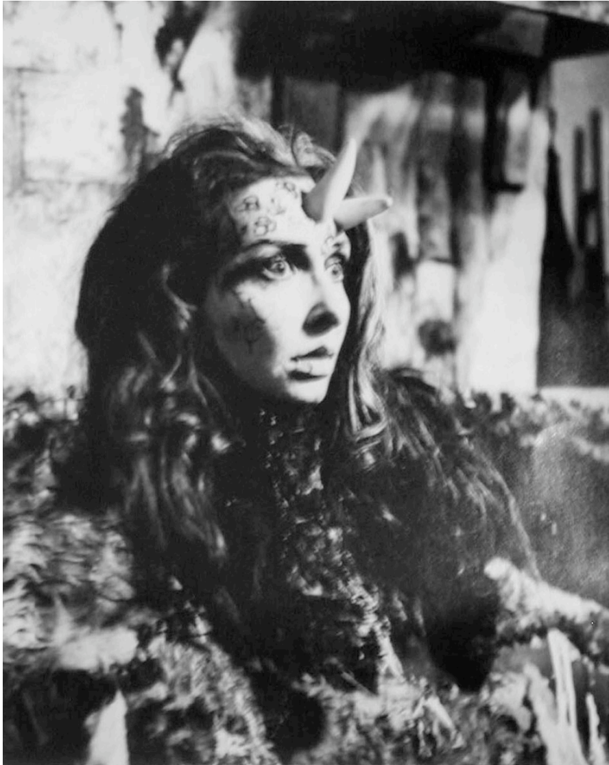
Eye Body #29 (Carolee Schneemann, 1963)