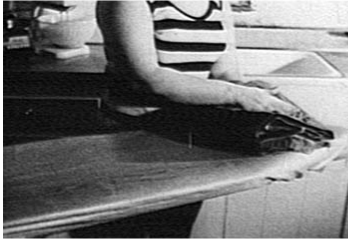
The Woman's Film (1971)