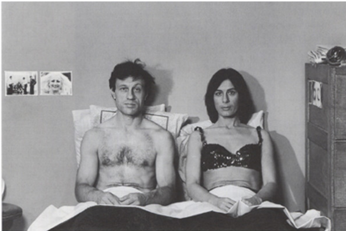
Kristina Talking Pictures (Yvonne Rainer, 1976)

The surprising fact is that the majority of films made by, for, and about women in the seventies were documentaries. The films centered on women and the issues they faced at home, at work, in the movement, in bed, and in doctor's offices—their quotidian experiences, in other words, and their struggles in a capitalist patriarchy (to use the language of the time). If this sounds quaint today, in the seventies this kind of filmmaking was innovative and radicalizing. The women featured in feminist documentaries were not expected to be glamorous, sexy, conniving, or even talented like the women in mainstream cinema. They were not femme fatales , smothering mothers, or bathing beauties. They were, in other words, women who had almost never appeared on screen before, telling stories that did not constitute escapist entertainment. On the contrary, the women portrayed in feminist documentaries told stories that were supposed to be kept secret: tales of abduction,