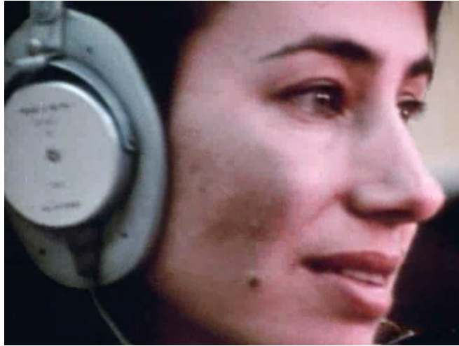
Filmmaker Joyce Chopra

Growing Up Female , Anything You Want to Be , The Woman's Film , and Joyce at 34 all reflect on the collective stories of women's lives, drawing attention to the way seemingly individual struggles actually speak to systematic problems, which require women to unite in a political movement of liberation. Though the films clearly insist on the power of "true" stories about "real women" to convey the multiple oppressions women face in a capitalist patriarchy, the cinematic techniques they deploy vary. If women filmmakers, several of whom, incidentally, started as "sound girls" for the fathers of Direct Cinema, deployed some of the codes and conventions of so-called documentary verité, they clearly set out to make their own kind of films, which could speak to, and account for, women's gendered experience in a world run by men and, most urgently, that would serve to convince women that they needed a women's liberation movement. 33