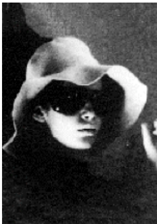
Anything You Want to Be (1971)

If Growing Up Female can be read as a conventional verité feminist documentary, Liane Brandon's Anything You Want To Be maps an alternative aesthetic. Rather than offer true stories of American womanhood, Brandon's short film features a single female character meant to stand in metonymically for all women. Anything You Want To Be treats the subject of role indoctrination with humor, irony, and simple trick photography. A young woman reads a book on politics that becomes a cookbook in her hands; from a scientist experimenting in a lab, she morphs into a harried young mother preparing bottles in the kitchen; from a high school graduate she transforms first into a bride wearing a veil then into a wife donning an apron. The message of the film echoes the call to arms in Growing Up Female , but the filmic techniques differ considerably. As the film closes, the voice-over goes haywire repeating, "You can be anything you want to be..." and the subject of the film goes mad; her piercing scream penetrates the final frames with a warning: American women are on the verge.