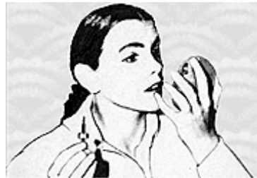
Growing Up Female (1971)