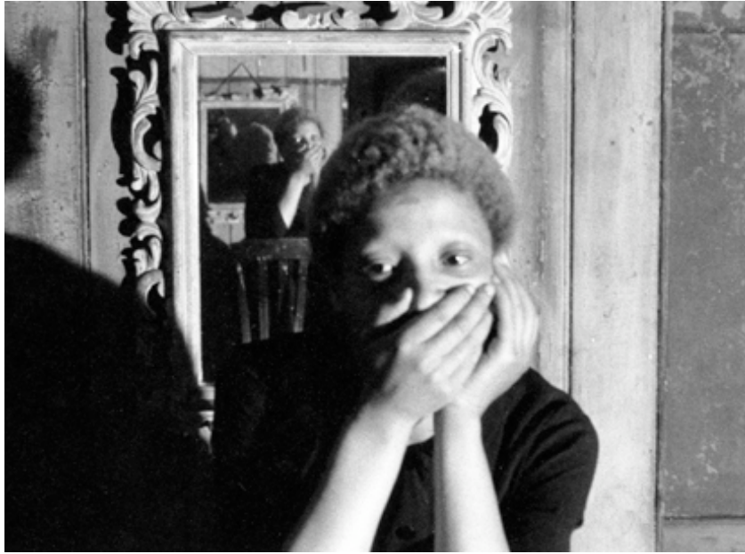
Thriller (Sally Potter, 1979)