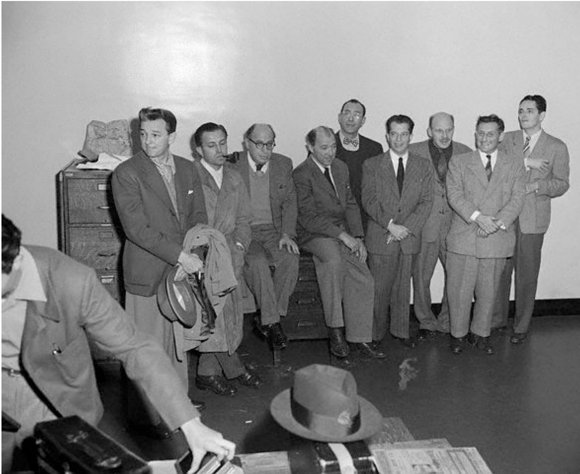
December 12, 1947, Washington, D.C. Nine of the Hollywood Ten await fingerprinting in the US Marshall's office after they surrendered. They are (left to right): Robert Scott, Edward Dmytryk, Samuel Ornitz, Lester Cole, Herbert Biberman, Albert Waltz, Alvah Bessie, John Lawson, and Ring Lardner, Jr. Dalton Trumbo is scheduled to appear shortly.

All, that is, except one: 28 "Howard Koch alone broke ranks with the strategy which had been agreed upon in early October." 29 The day of the Waldorf Decision, Koch publicly disassociated himself from the Communist Party. In a 26 November 1947 advertisement in the Hollywood Reporter entitled "Letter to my Fellow Workers in the Motion Picture Industry," Koch announced that he had made a "sworn statement of non-affiliation." Koch went on to explain that, although he had made a sworn statement, he "reserves the right to refuse to make it if I so choose at any future hearing of the House Committee on un-American Activities." 30 Koch even implied that he had wanted the chance to take a stand against the Committee. Inspired, perhaps, by a recent decision of the New York State Court of Appeals ruling red-baiting libelous, 31 Koch stated that he had been "libeled three times," but had not been provided the opportunity to "face my accusers." 32 In effect, Koch negotiated a very different strategy from the Ten, a strategy both demanded and facilitated by the divergences Ceplair and Englund want to brush away: on the one hand, his salary meant he had more to lose than some of the more vocal members of the Ten; 33 on the other hand, his non-communist status made an affidavit of non-affiliation a viable possibility.